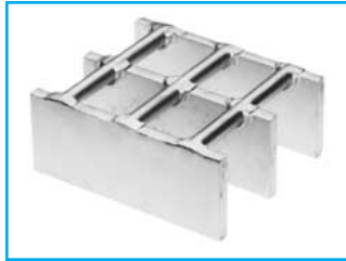
38-H-2 Cross Rods 2" C/C

U = safe uniform load, psf C = safe concentrated load, pfw D = deflection, inches E = modulus of elasticity, 29,000,000 psi F = fiber stress, 20,000 psi