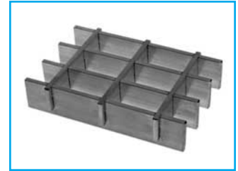
19-AP-2 Cross Bars 2" C/C