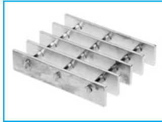
19-SR-2 Cross Rods 2" C/C