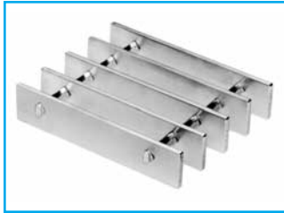
19-SR-4 Cross Rods 4" C/C

1-3/16" Center to Center of Bearing Bars